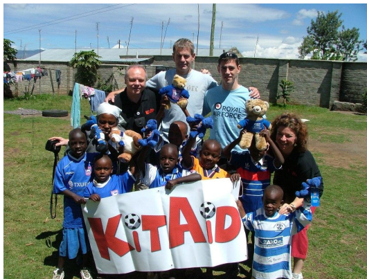
The team at Saidia in Gilgil