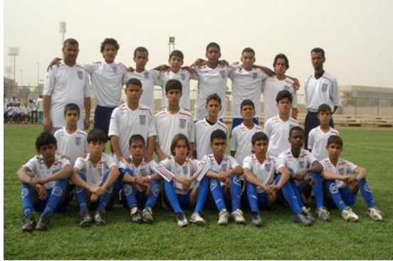
Children in England shirts