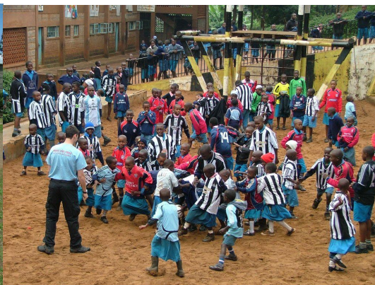
Kibagare Good News Centre