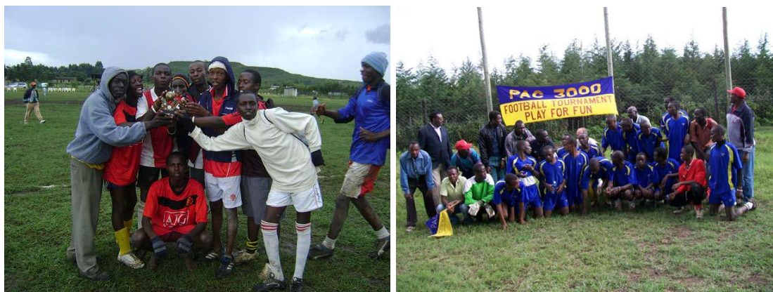
Shots from the Gilgil Tournament